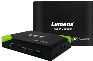
Lumens OIP Bridge

Tasked with capturing audience views or wide-angle shots of the venue. It works in tandem with the tracking camera to provide remote viewers with an immersive, multi-angle visual experience.